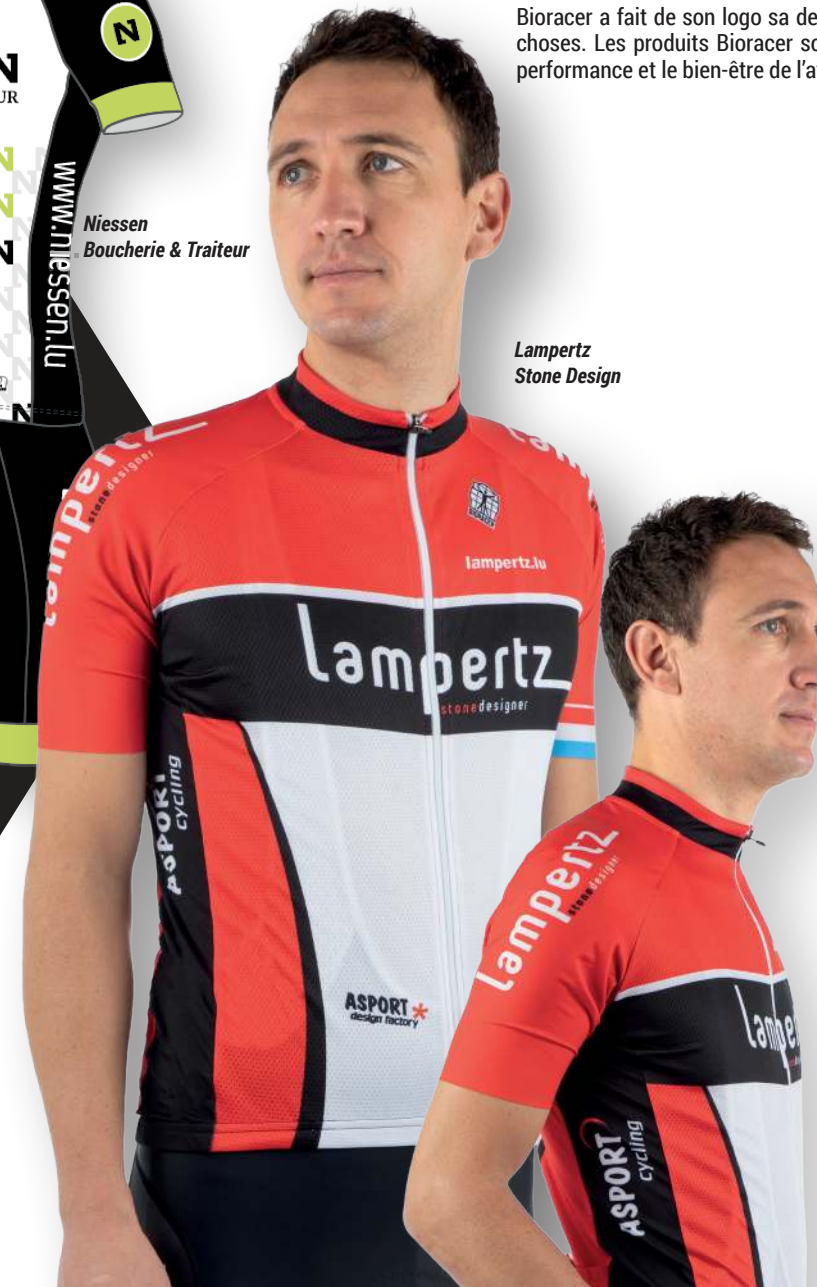
Lampertz Stone Design

Bioracer a fait de son logo sa devise, l'homme est la mesure de toutes choses. Les produits Bioracer sont constitués de façon à améliorer la performance et le bien-être de l'athlète qu'il soit de haut niveau ou pas.