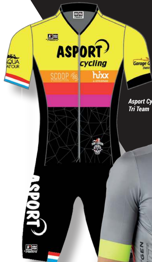
Asport Cycling Tri Team