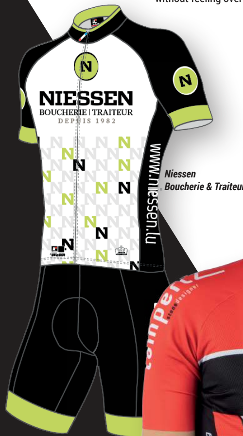
Niessen Boucherie & Traiteur

Those uniforms are designed to have all-day comfort but still provide an aero advantage. Whatever your size or body shape those uniforms perfectly match the contours of your body, without feeling overly tight or restrictive