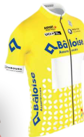
Leader Jersey Skoda Tour de Luxembourg